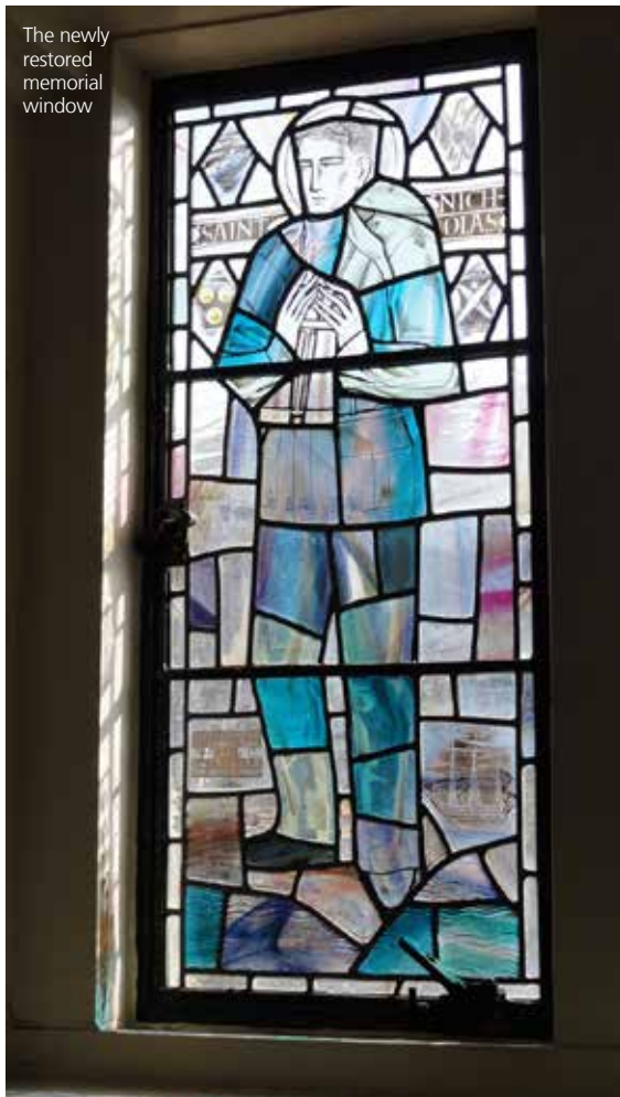
The newly restored memorial window

A TEAM of sailors from Victory Squadron, HMS Collingwood, spent time helping to restore the Submarine Service Memorial Chapel at Fort Blockhouse, Gosport, recently, ahead of an important visit.